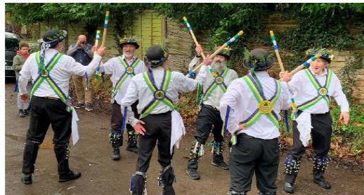
Letchworth Morris Men

Live music during afternoon and into evening